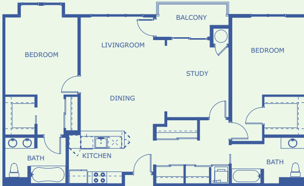
Alternate A: Expanded living room.

Typical configuration: See plan opposite.