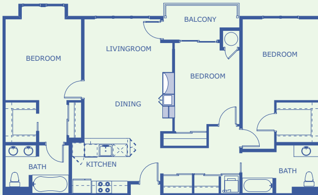
Alternate C: Cabinetry wall with integrated sound system.

More information is available at the brokers office to aid you with your choice.